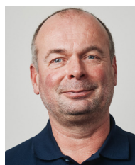
Bert Int Panis Internal Service