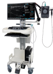
EMG & EP