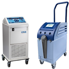
Patient Temperature Management