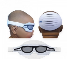
Maternal Infant Care