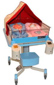
BabyBed & BabyWarmer