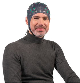
Accessories & Supplies