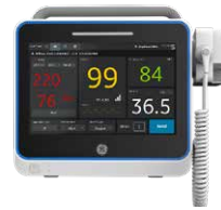
Vital Signs Monitoren