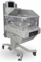
Incubatoren en infant warmers