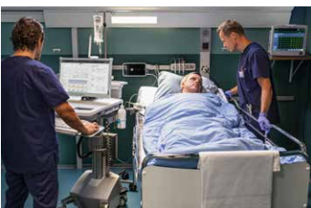
Centric Neonatal Critical Care