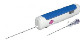
Biopsie instrumenten en naalden