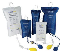
Drukkzakken voor infusie