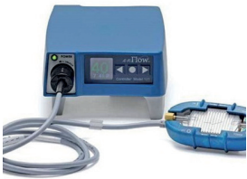
Bloed- en vloeistof-verwarmer