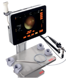
Ultrasound guided Micro-endoscopy