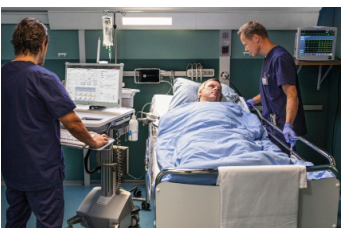
Centric Neonatal Critical Care