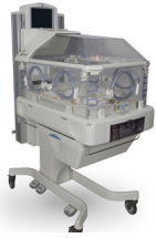
Incubatoren en infant warmers