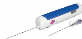
Biopsie instrumenten en naalden