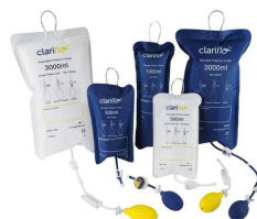
Drukkzakken voor infusie