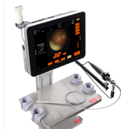
Ultrasound guided Micro-endoscopy