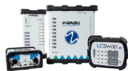
IntraOperative Neurophysiological Monitoring Cascade IOMAX