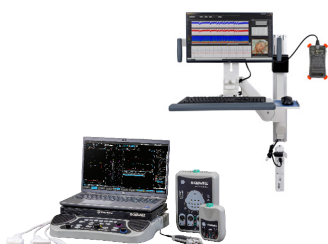
EMG – EP – Ultrasound EEG – LTM - ICU Cadwell