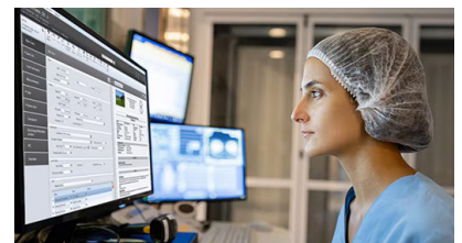
Geïntegreerde cardiologische beeldvorming en workflowoplossing: CCE