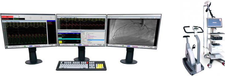
Hemodynamische metingen MAC-LAB BT22 & Elektrofysiologische procedures CARDIOLAB BT22