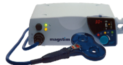
Magstim Magnetic Stimulation