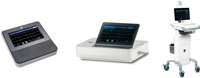
Rust ECG: MAC5 - MAC7 - MACVU360