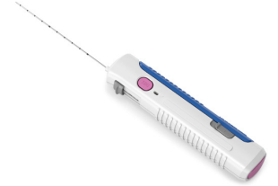
Bot & Beenmerg biopsie