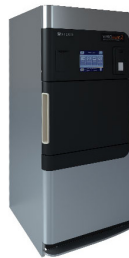
Low Temperature Sterilizer