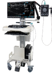
EMG & EP