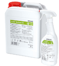
Cleaning products and disinfectants