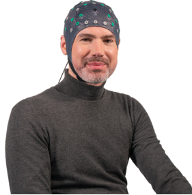
Accessories & Supplies