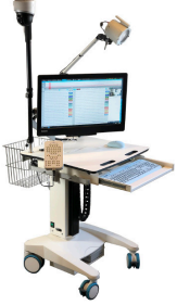
EEG & LTM