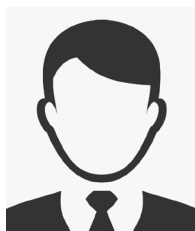
Open Position Account Manager CE Zuid-Oost