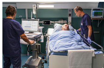
CHA Critical Care