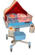
BabyBed & BabyWarmer