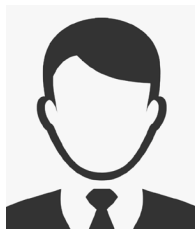
Open Position Account Manager CE Zuid-Oost