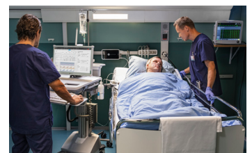
Centricity Neonatal Critical Care