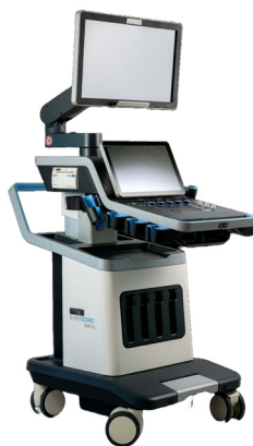
Super Sonic Imaging