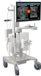
MRI fusie biopsie