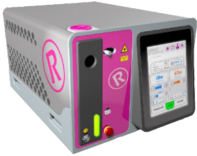
Laser TLF & OLEP